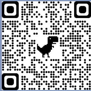
Preparedness Kit Worksheet